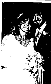
Maxus Sly Fox before leaving for a trip to the Smoky Mountains. They will make their home in Westland.