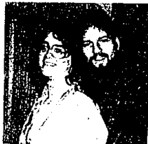
A November wedding is planned in St. Paul Lutheran Church, Northville.