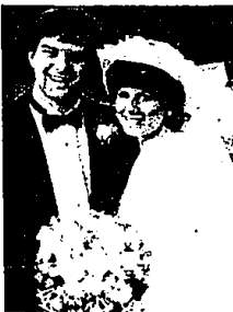
Michigan University, employed as an employment specialist for Steelcase Inc.