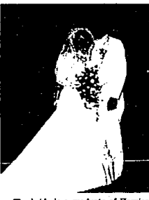
The bride is a graduate of Harrison High School and Oakland Community College, employed as a secretary for Mercy College, Detroit.