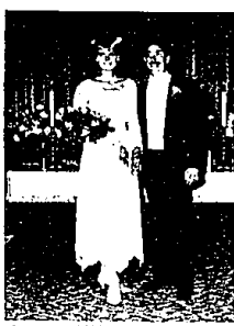
from Eastern New Mexico University with a bachelor's degree in theater. He did graduate work at the University of Oklahoma. He is production director of the Meadow Brook Music Festival.