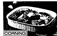
22.50 Oven-, Microwave- And Dishwasher Safe French White™ 4½-qt. Dish Large and versatile. Use as a casserole or open roaster.