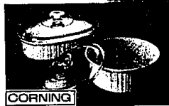
21.00 Each Oven-, Microwave- And Dishwasher Safe French White™ Casseroles 2½-qt. covered casserole dishes in round or oval.

223 W. Maple, Downtown Birmingham Open 10-9 Mon. Thru Fri., 10-6 Sat., 12-5 Sun. Seasonal Store Hours in Effect Thru Dec. 24.