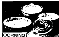
39.50 Set Oven-, Microwave- And Dishwasher Safe French Bisque Corningware Set of 1½-, 2½-qt. covered casseroles, 10" pie plate