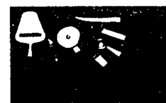
9.97 7-pc. Kitchen Gadget Set Stainless steel set for vegetables, fruit, cheese, more.