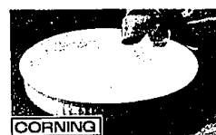
10.00 Oven-, Microwave- And Dishwasher Safe 8½" Plate Elegantly classic styled plate for pie or quiche.