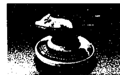
18.50 Adjustable Kitchen Scale Measures 20 to 2800 grams, 1 oz. to 6 lbs. With tray.