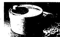
6.96 Reg. 9.96 Salad Spinner Helpmate Slotted inner basket helps clean and dry salad. Plastic.