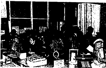
Christmas rush, 1950s style, at Trombley's Farmington Post Office.

In an earlier test by 42 snowbelt automotive writers and 15 Chicago-based airport limousine drivers, 89 percent agreed that snow blades were superior to conventional types in snow and ice conditions.