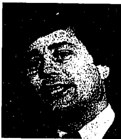
Gov. James Blanchard property tax "burdensome"