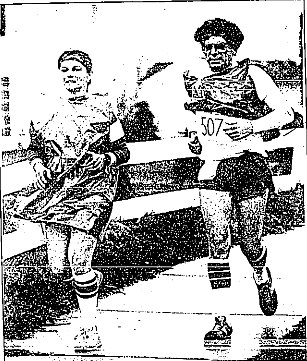
Even rainy weather won't deter the diehard runners who take to the tracks to quench their thirst for racing competition.