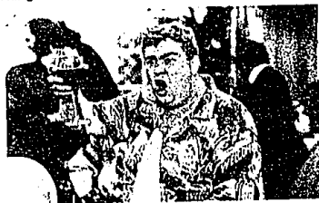
John Candy is Brewster's friend Spike, who enjoys life to the hilt.

"Brewster's Millions" benefits from that kind of gracefulness which keeps the comedy and pacing from overwhelming the audience. It's just a nice, old-fashioned entertainment well worth an evening at the movies.