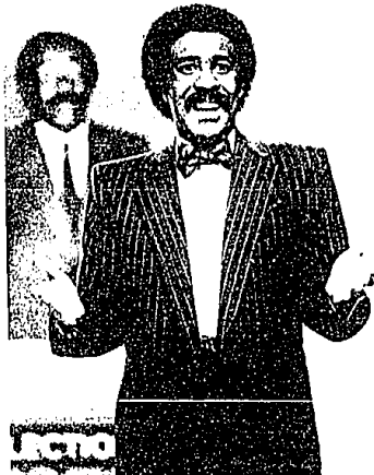
Richard Pryor is Montgomery Brewster, a baseball player in the minors, who gets a chance to inherit $300 million if he can spend $30 million.