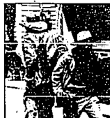
HOT LEAD, COLD FEET