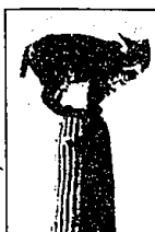
THE LIVING DESERT

MetroVision of Oakland 37635 Enterprise Court Farmington Hills, MI 48018