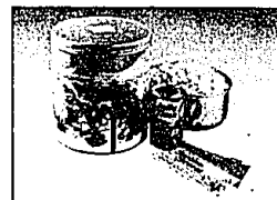
DISNEY HOME THEATRE PACKAGE