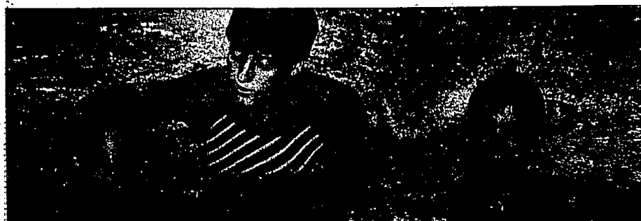
Amy Inch teaches swimming skills to two youngsters. Swimming lessons are also a part of the day's activities for the YMCA day camps.