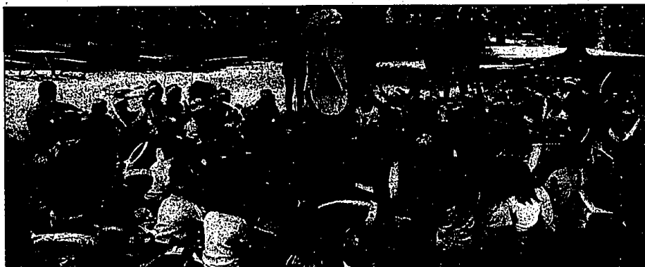
The youngsters at the YMCA's Summer Fun Day Camp gather around for a story.