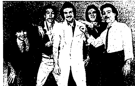
The Teen Angels puts on a show at Summer Nights at the Troy Hilton. Song hits from the '50s to the '80s will be highlighted.

"Summer Solid Gold," Ricky Nelson, Joey Dee and the Starlighters, the Contours, the Diamonds, the Angels and the Shirelles. Fireworks 8 p.m. Saturday, July 6