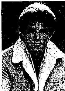
Ricky Nelson rocks in "Summer Solid Gold" at Meadow Brook.

Don Henley with special guest Katrina and the Waves 7:30 p.m. Saturday, July 6