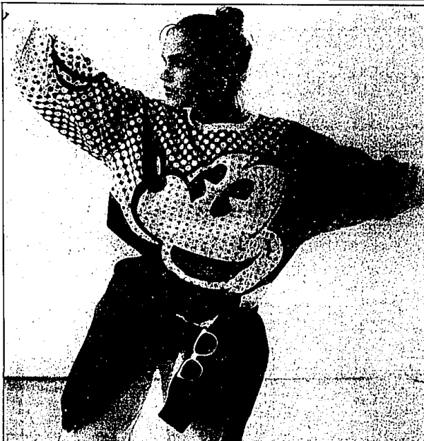
Mickey Mouse on anything is the name of the fashion game these days. Here Mickey adorns a polka-dot print, oversized