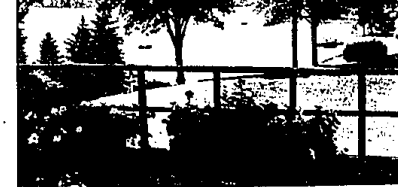
LAKEFRONT RANCH with panoramic view. Four bedrooms, family room and rec room. 3 fireplaces. Large deck off upper level. $359,500 RUR 73225 Call 644-6700. E. off Green Lake Rd., S. of Commerce Rd.