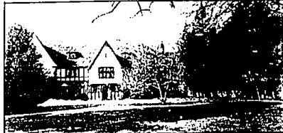
A COUNTRY ENGLISH MANOR in the City of Bloomfield Hills. This estate includes four two-room suites, guest rooms, four-room maid's quarters and seven fireplaces. Ballroom size living room and dining room. Call 644-6700. SHM 66757