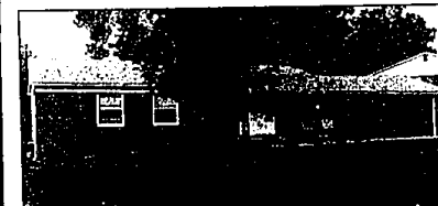
BRICK RANCH with finished lower level walk-out, 4 bedrooms, family room with fireplace and 3 baths. $129,700 JWE 73330 Call 644-6700.