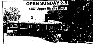
OPEN SUNDAY 2-5 5857 Upper Stratts Blvd.