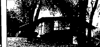
HILL-TOP SETTING off Lone Pine Road. Custom one-owner contemporary home with vaulted natural wood ceilings throughout plus library, Florida room and lake privileges on Walnut Lake. Truly unique. $159,900 Call 644-6700. DRJ 70062