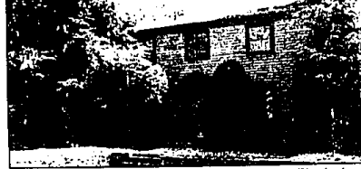
ALMOST TWO ACRES minutes from downtown Birmingham. Large rooms in this 4 bedroom brick colonial. Family room, large master bedroom with loads of closet space and central air. $168,900 Call 644-6700. DKJ 68006