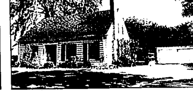
CHARMING CAPE COD with much updating. Three bedrooms, library and fireplace. Birmingham Schools. $119,900 GYK Call 644-6700.