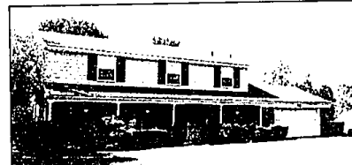
BLOOMFIELD TOWNSHIP within the Birmingham School system. Clean and open 4 bedroom colonial decorated in neutrals. Family room with fireplace. Treed lot. Brick and aluminum exterior. $129,900. Call 644-6700. PQS 71191