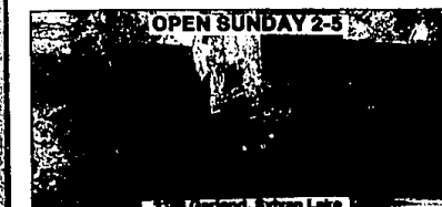
OPEN SUNDAY 2-5 2100 Garland, Sylvan Lake