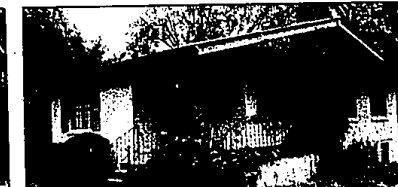
LEFT YOUR HEART IN SAN FRANCISCO? Soothe your feelings in this downtown "Dollhouse." New kitchen and bath, walk-out lower level to a wonderful backyard. Stone fireplace. $109,900. Call 644-6700. KRW 71990