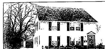
DUPLEX IN BIRMINGHAM. Each unit has 2 bedrooms, separate dining room and all appliances including washer and dryer. Recent improvements. 2 car garage. Good location. $105,000. Call 644-6700. NLK 64441