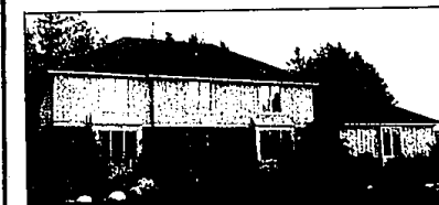
QUALITY, CHARM & COMFORT. A two-story colonial with 4 bedrooms, separate dining room, library, family room with fireplace and rec room, located on a deep wooded lot. $225,000 JWE 73228 Call 644-6700.