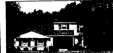
EXCELLENT BLOOMFIELD LOCATION with Andover High School nearby. Five bedrooms, family room, recreation room, patio and separate dining room. Well maintained. Ready to move in. $152,500 Call 644-6700. GVK 71065