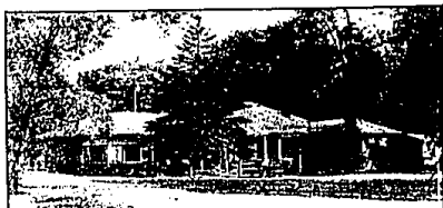
92' of CASS LAKE FRONTAGE. Enjoy view from living room or family room. Deck with gas barbecue fronts the lake with gas barbecue. $154,900 PDK 69222 Call 626-4000.