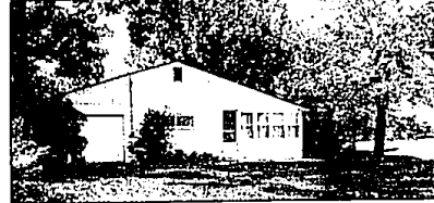
100' OF SYLVAN LAKE FRONT. Full bath cottage with 3 bedrooms, city water and sewer. Swimming and large boat dock. Land Contract available. $62,500 ABR 73210 Call 626-4000.