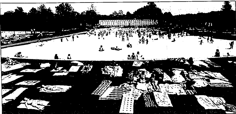
Red Oaks Park in Madison Heights will be the site of Oakland County's second wave pool. The first (pictured) was built in 1978 in Waterford Oaks Park in northern Oakland.