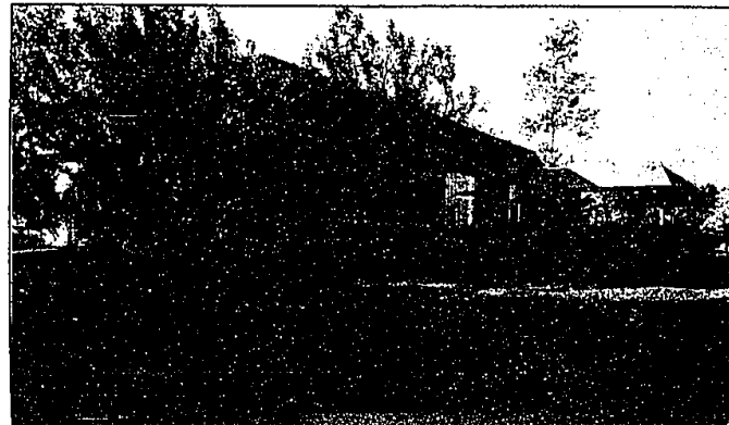
The Farmington Hills Municipal Offices, opened in 1982 and enlarged in 1982 and 1983, is at the southwest corner of 11 Mile and Orchard Lake roads.