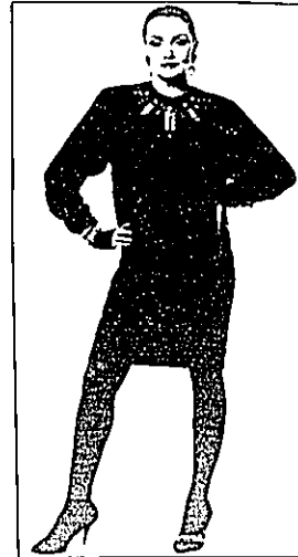
Parties are apt to be sumptuous and dress elegant for this season's holiday circuit. Go anywhere in this basic black, which can be dressed up or down depending on the occasion.

Black also provides an ideal contrast to this season's glitzy metallic fabrics. Geoffrey Beene's molten gold-lame top glows over a long, curvy, high-waisted skirt. In her premier collection under her own name, Donna Karan revived and glamorized the simple bodysuit by re-designing it in luxurious cashmere with broadened shoulders. She then wrapped it with a shiny golden srong and enveloped both pieces in an oversize sweatercoat.