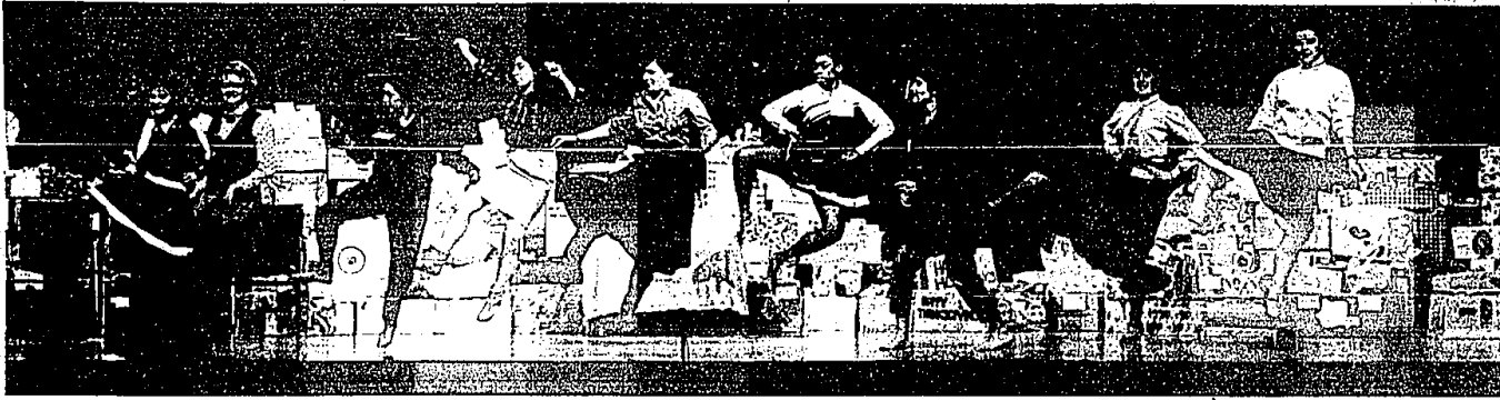
Dancers trying out for the chorus or specialty numbers in "Annie Get Your Gun" auditioned individually or in groups against a back ground of holiday packages. During auditions the stage was set with food gifts the students had prepared to be distributed by Focus Hope. Before the cast is chosen the girls will have launched their holiday clothing drive.