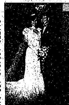
The couple received guests in Overture Recording Studio before leaving on a trip to the Virgin Islands. They will make their home in Northville.

The bride is a graduate of Mercy High School, employed as a dance instructor at Dance Dynamics in Walled Lake. The groom is a graduate of Northville High School employed as a recording engineer for Overture Recordings.