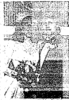
The couple received guests in Detroit Golf Club before leaving for a honeymoon in Jamaica. They will make their home in Pontiac.