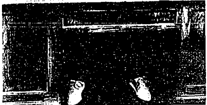
upcoming things to do