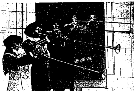
Horns herald Oakway Symphony's Wassail Dinner festivities, coming up at Madonna College in Livonia.

The second annual Dickens' Christmas Celebration will be at 6:30 p.m.