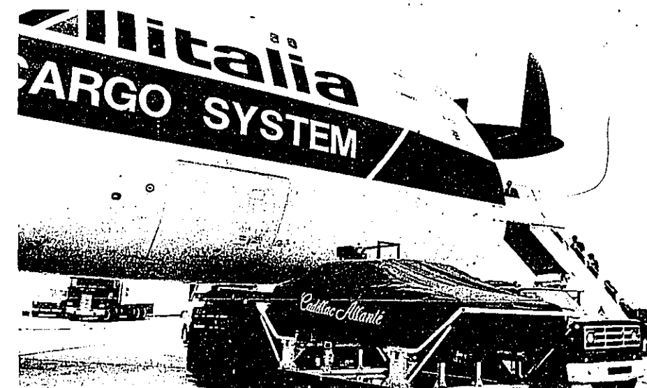
Alitalia and Lufthansa jets will transport Cadillac Allante bodies to the United States from Turin, Italy, and carry parts back to Italy.

From Metropolitan Airport, Allante bodies will be delivered to General Motors new Detroit-Hamtramck Assembly Center where Allante's power train and