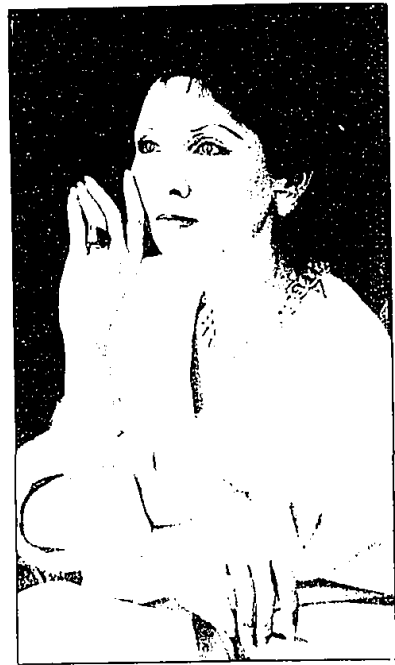
The quiet cool gleam of silver in solid sterling necklace, $685; bracelet, $375; wide cuff, $495; earrings, $115; and black carved onyx ring, $470. Charles W. Warren, Somerset Mall, Troy.