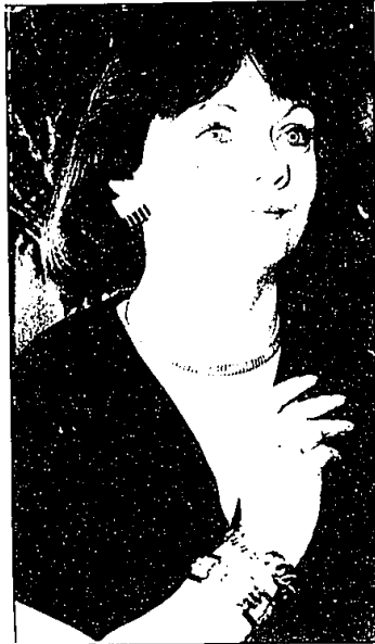
Gold makes a bold statement in a curved gooseneck necklace, $2,640; textured earrings, $375; gold chain bracelets, $1,450 and $1,300. Greenstone's, Birmingham.

528 North Woodward Avenue • Birmingham • 4 Blocks North of Maple • (513) 642-2650 Mon. thru Fri. 9:30-6:00; Sat. until 5:00 • Major Credit Cards Welcome