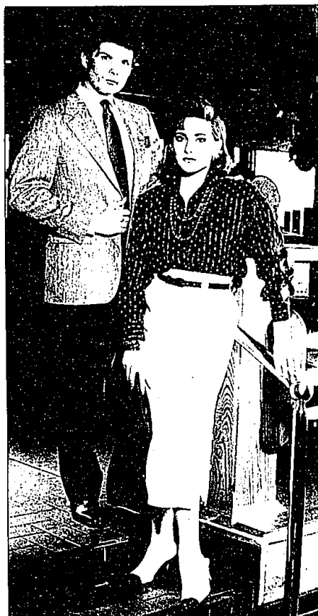
Black and white makes the transition from day to night by removing the Anne Klein II chrome yellow silk jacket, $188, and opening the side buttons of the Anne Klein II white linen skirt, $104; the black and white linen blouse by Evan-Picone, $200, is opened at the collar for night drama. Accessories make the transition easy: black Spectator pump, black patent shoulder bag from Anne Klein, oversized watch, and black sunglasses. A red silk tie and pocket square are all that are needed to give the gentleman a new nighttime look. His black-and-white herringbone silk jacket, Bill Blass, $170, is complemented by a Louis Raphael white cotton shirt, black pleated pants and pale gold tie with black print. His black leather tie shoes are by Freeman. All from Hudson's.