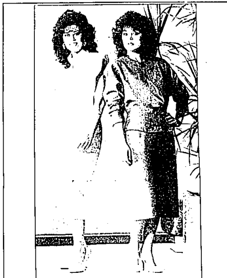
Three-piece elegantly tailored lunch hour suits