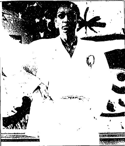
Curved and crisp charmeuse and white linen combine in a three-piece ensemble by Linea Z. The slim, curved hip skirt has a deep back vent, $180. The blouse has a triangular back cut-out and front patch pockets, $250. The cased cardigan jacket is $280. Ivory oval earrings, $105. Roz & Sterm, Bloomfield Plaza. Hairstyle by David Munson, Mariomax Salon.

Accessories dot the warm-weather fashion scene with new importance. Lively shoes tone to the garment or act as a pastel or primary accessory point; handbags are smaller, more stylized and often make a strong color statement. Lettuce pin, $115; pink leather shoulder bag, $150; pearls with gold flower clasp, $250; primary color leather pump with cut-outs, $115. Roz & Sterm, Bloomfield Plaza.