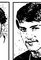
Steve Hawley John Glenn