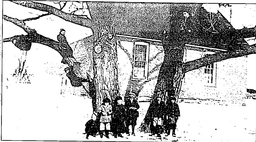
The Nichols School. It used to be at Farmington and 13 Mile Roads.