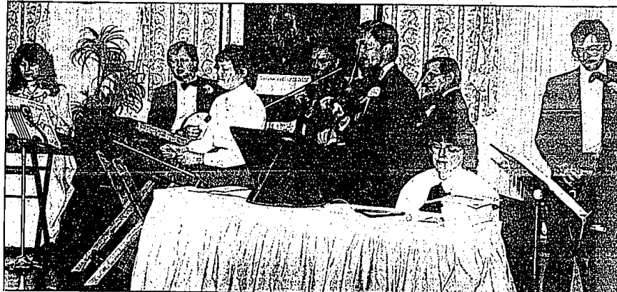
The Olde Michigan Ruffwater Stringband played music appropriate to the 1800s.

"When faced with the prospect of leaving family, career and friends to go and dry out, we believe that many