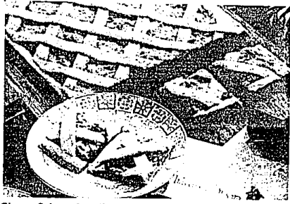
Cheesy Salmon Appetizers are perfect for spring graduation or wedding parties.

Delicately flavored canned salmon is available in several can sizes and varieties to suit all needs. The different varieties of salmon vary mainly in color and oil content.