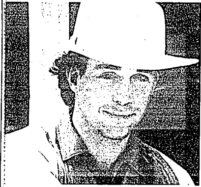
Tom Hulce is Jonathan, a pizza deliveryman who is also a poet-songwriter, in "Echo Park."