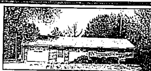
NEAT 3 BEDROOM RANCH on large lot, 1/4 acre, for the small family with a lot of privacy. Newly painted. Immediate occupancy. Motivated seller. $57,000. 559-2300.