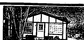
REDUCED TO $38,900. Park your boat on Elizabeth Lake. Clean 3 bedroom Tri-Level on quiet street in Waterford within walking distance to lake. Home has many extras. 348-6430.