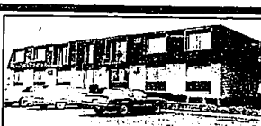
SPACIOUS CONDO - Excellent investment, 2 bedroom, ground floor ranch style condo with neutral decor, refrigerator and stove stay. Patio - convenient location. $29,500. 681-5700.