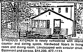
SPACIOUS KITCHEN is newly remodeled with island counter and eating space. Hardwood floors in living room and dining room. Landscaped with circular drive. Basement and garage. $44,200. 477-1111.