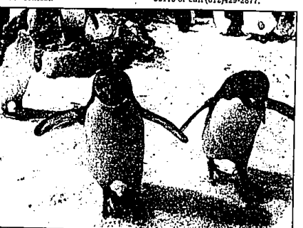
See World in Ohio has such things as these Macaroni penguins. The park has 110 Penguins in a year-round science center which features daily snowfalls and polar terrain.

Spokesongs rates their trips from novice class to advanced depending upon experience and quality of physical fitness. Package tours are available including lodging, all meals, support van and use of helmets. For free brochure, contact Spokesongs, 130 Fir Street, Mahomet, Minn. 55115 or call (612)429-2877.