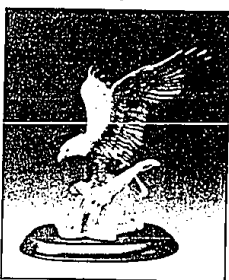
"Spreading Its Wings"

"American Eagle Gallery" The most complete selection of handcrafted, fine porcelain Eagles