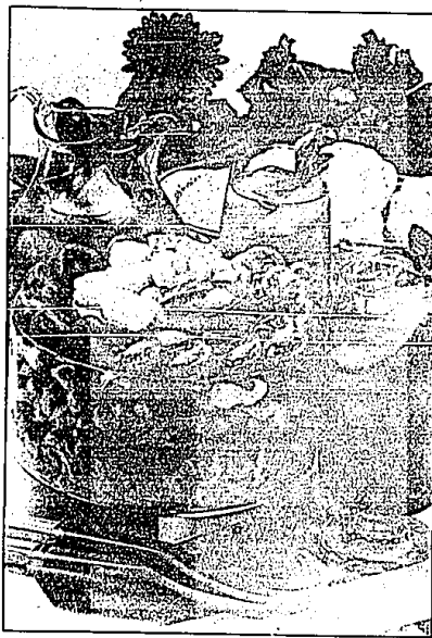
An eye-catching layered salad, hot biscuits and tall glasses of amber-clear iced tea make for great summer dining.

In large salad bowl, place first three ingredients in layers starting with lettuce, then spinach, then macaroni. Scatter celery, green