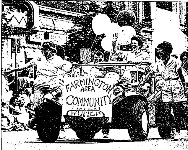
The Farmington Area Community Women enjoy the crowd's acceptance of their float.