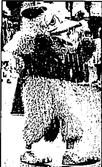
Charlie the Chicken belongs to the Farmington Area Jaycees.