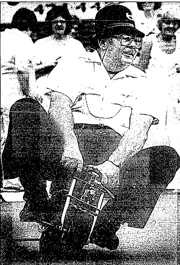
One of the Keystone Kops from the Muslim Shrine takes to the road on a miniature scooter.