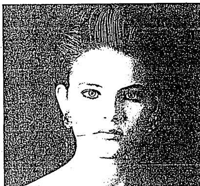
New freshness is the fashion makeup look for fall.

T HE FASHION collection for fall features darker colors than has been in the news for some time.