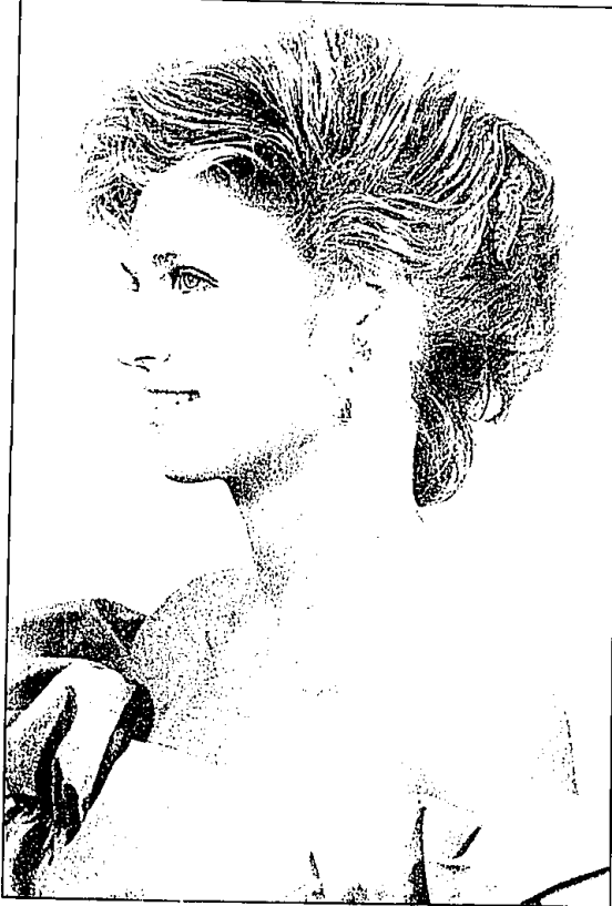
Sideswept and pinned back with a jeweled pin is the look of elegance for formal evening wear. Styled by Grace Scalia, Headline Salon, West Bloomfield.