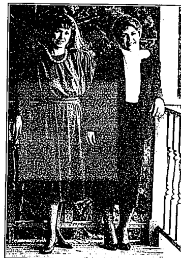
Anko... the dress, Austin Reed... the suit

His black tuxedo suit by Christian Dior Monsieur, $295. Her black velvet, satin and rhinestone trim gown is by Scaasi Boutique, $1,700. Both are from Jacobson's.