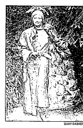
Soft, supple gray leather dresses in leath, gray fox sections. Coat $2,500. Matching gray leather skirt, $500. Robert Mann Furs, Appleton Square, Southfield.