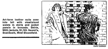
Art-form leather suits ease into fall with elasticated waists in skirts and jacket panels in brocade. Skirts, $625; jackets, $1,155. Mom's, Boardwalk, West Bloomfield.