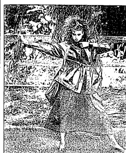
Bette Appel's bronzed, waterproofed jacket and bag with zebra-patterned khaki and bronze funnel neck shirt. The skirt is bronzed onyx with button back. Available early September. Bette Appel, Boardwalk, West Bloomfield and Bloomfield Hills.