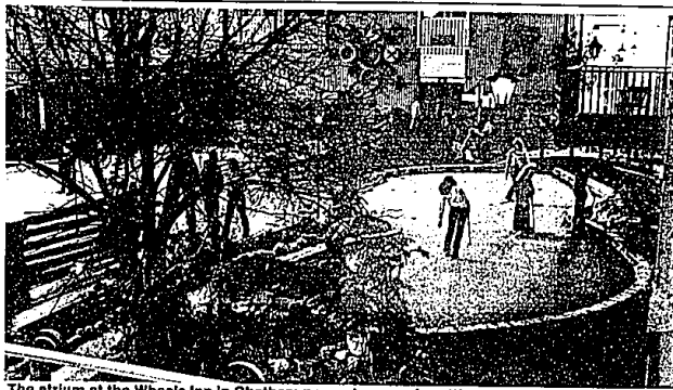
The atrium of the Wheels Inn in Chatham presents a scenic setting.

As for me, I'm just going to sit here in the sunshine and watch the sea otters going by on their way to other fabulous destinations