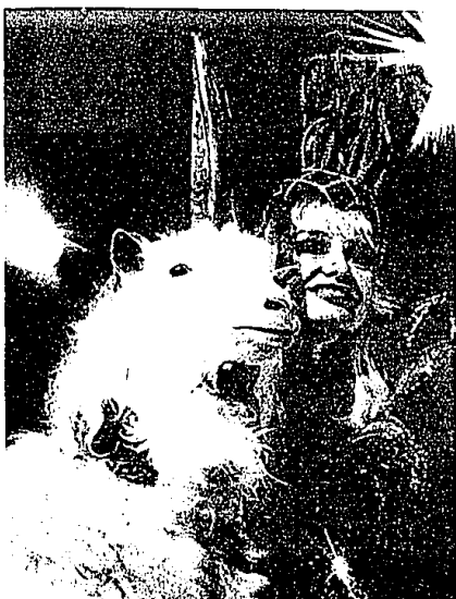
A real, live unicorn? Well, judge for yourself when the circus comes to the Joe Louis Arena in Detroit Sept. 30 through Oct. 5.