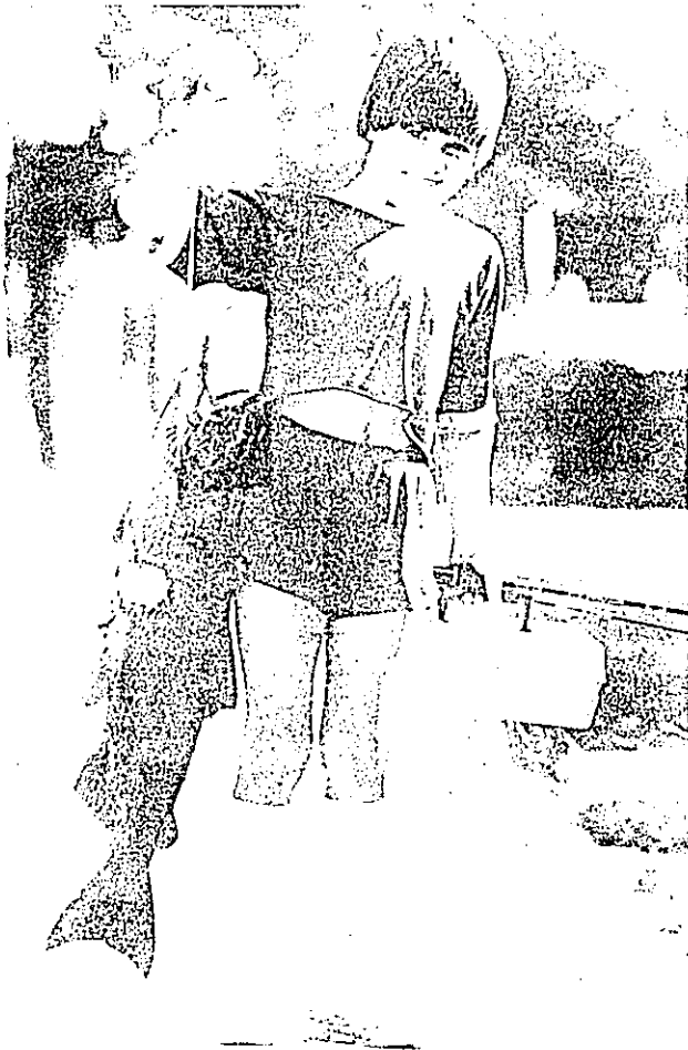
This young angler holds up a large salmon he hooked in the Boardman River by the Union Street Dam in Traverse City. The huge fish each fall make their way into area rivers and streams and anglers of all ages are out daily hoping for a little fishing luck.

With 1,000 inland lakes within a 50-mile radius of Traverse City, who could possibly know which one is the best? That's good enough reason to try fishing as many as possible right now. It's a good bet that none will disappoint the fisherman who knows what he or she is doing!