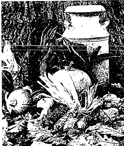
Monte Nagler captured the essence of the season with its many values, tones and textures in this black-and-white still life. Note how the tree bark in the background and the fallen leaves in the foreground add to the impact of the picture.