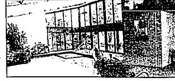
WABEEK CONTEMPORARY features 4 bedrooms (master with fireplace and magnificent view of the countryside), 3 1/2 baths, step-down living room and ELEVATOR TO BEDROOM AREA. Beautiful INDOOR POOL. $445,000 H-86366