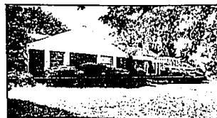
LOVELY LATHRUP VILLAGE home with large lot and SOLAR HEATED POOL surrounded by well-designed deck area and beautiful landscaping. Features 3 bedrooms (possible 4th in basement), 3 baths, great kitchen, 2 fireplaces and Florida room. $39,500 H-87053