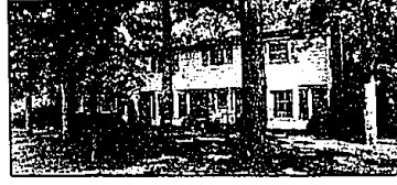
OPEN SUNDAY 1:30 to 5, 4159 Nowland Drive West, West Bloomfield, (S. of Long Lake and W. of Middlebelt) CHARMING COLONIAL with large rooms and wooded lot features family room with adjoining Florida room and rec room with fireplace on lower level. Bloomfield Hills Schools. $159,500 H-86488