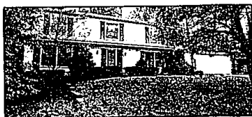
GEORGETOWN HOME features 4 bedrooms, 2 full and 2 half baths, bay window in breakfast area, family room with pegged floor, fireplace and built-ins. Lower level walk-out to private deck and LOW MAINTENANCE WOODED RAVINE LOT. $285,000 H-87593