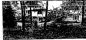
CITY OF BLOOMFIELD HILLS. Features spectacular INDOOR POOL, 4 bedrooms, 4 baths, skylights, cathedral ceilings, library, wet bar in pool room, JACUZZI, SAUNA and more. IMMEDIATE POSSESSION. $279,500 H-78337