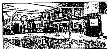
PERFECT HOME FOR ENTERTAINING near GENERAL MOTORS PROVIDING GROUNDS features 4 bedrooms, 3 baths, indoor pool with rooms and balcony surrounding. Wonderful relaxed atmosphere and nature's beauty all around. $375,000 H-86142