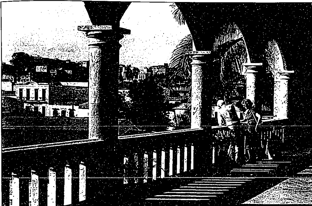
Casa de Colon, circa 1510, home of Christopher Columbus' son, in Santo Domingo.

The only nearby place to visit outside the resort is probably Baya Hibe, where you can sit and watch the sun go down while drinking beer and eating fresh seafood in an open-sided local bar.