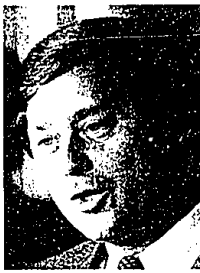
Gov. James J. Blanchard Chrysler confident

CHRYSLER'S investment in the Oakland Technology Park east of Pontiac will strengthen Michigan's position as a world center of advanced manufacturing technology, Blanchard said as he joined Chrysler Chairman Lee Iacocca in ground-