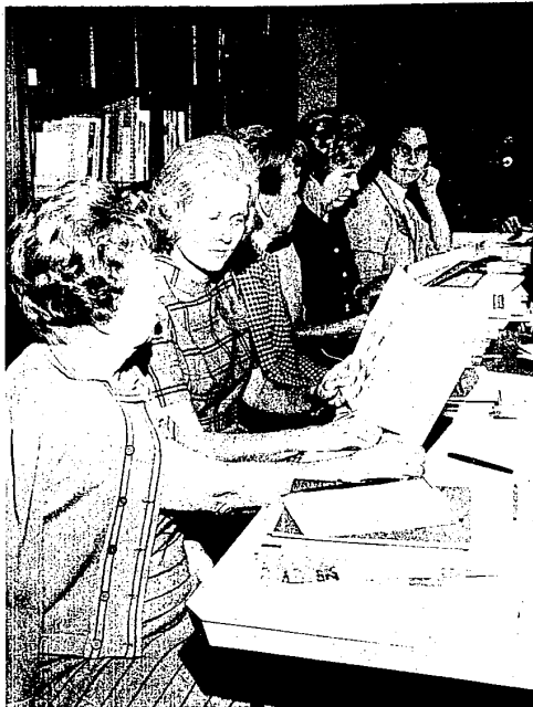
TRAINING SESSION -- Church women from the Farmington area met recently in Antioch Lutheran Church to learn Dr. Frank Laubach's method of teaching adults to read.

For example, the letter b starts with a fat bird, pictured with his tail in the air to form the stem of the letter. Then the student progresses to forming