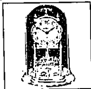
This lovely 9" anniversary clock from Howard Utter has a delicate rose pattern on its cream colored face. The brass-finished pendulum, pillars and base reflect beautifully in the glass dome. Reg. $55