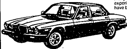
Jaguar XJ6 Vanden Plas

It is the nature of automotive styling to be transient. And it is the nature of Jaguar to create cars of classic grace: cars whose beauty endures long after the fads are forgotten. Such a car is the Series III. Combining beauty of form with quick response and noble luxury, the XJ6 rewards its driver in many ways. Come in and experience the pleasures that have been bred into the best Jaguar ever built. Substitute transportation now available. Falvey Motors will leave a vehicle for your use when we pick up your Jaguar at your home or office. After servicing your Jaguar we'll return it to your doorstep.