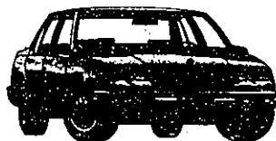
1987 Le Sabre

V-6 Auto Electric Touch climate control, power steering and brakes, air conditioning, electric door locks P205/65R15 all season whitewall radials plus more. Stock #H087