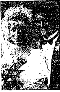
The couple received guests immediately after the ceremony in Mercy Center before leaving on a wedding trip to Myrtle Beach, S.C. They are making their home in Farmington Hills.

The bride is a graduate of North Farmington High School and Ferris State College, employed as manager for Kentucky Fried Chicken in Union Lake. The groom is a graduate of Harrison High School and Ferris State College, employed as a prototype automotive technician for Livernois Vehicle Co.