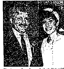
She is employed as a hairstylist with Les Cleaux Salon and he is employed by Sea Club Resorts, both in Sarasota.

The bride attended St. Joseph High School in Kenosha, Kenosha Beauty School and University of Wisconsin at Whitewater. The groom attended Farmington High School and Western Michigan University.