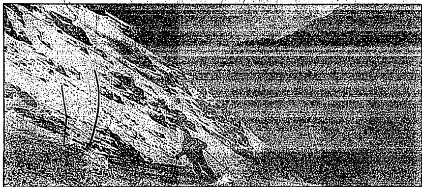
Skiing near the top of Blackcomb Mountain in the Whistler Ski Resort area of British Columbia.

"Whistler is the best ski area in Canada," he said. "The only com-